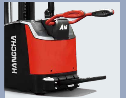
The integrated stamping molded guardrail offers better protection for the operator